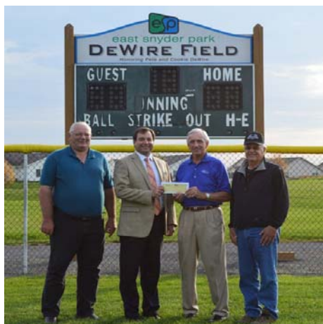
Mifflinburg Bank & Trust supports East Snyder Park with a $3000 donation to replace the scoreboard at DeWire field.

Use any of the above contact information to confirm whether or not you are registered, to get registered or apply for an absentee ballot.